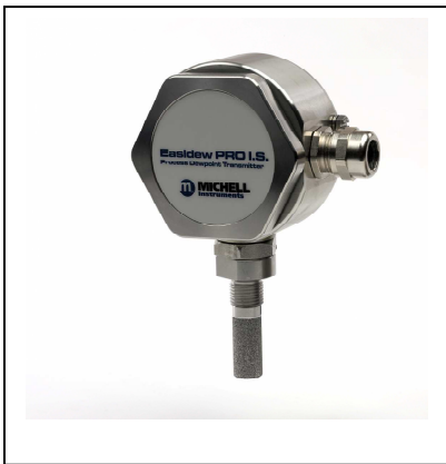
Easidew PRO I.S.