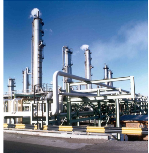
Sasol Refinery, South Africa

The control of moisture content in hydrogen recycled gas is critical to ensure the efficient operation of the plant. It is desirable for the benefit of the catalytic reactions to maintain the moisture level within the 10 to 20ppm v range. If the moisture level decreases below this level, the catalyst will deteriorate, causing a loss of productivity. High moisture content will remove chloride from the catalyst, accelerating catalytic activity loss to the point whereby high octane levels can no longer be achieved. The effects of both these scenarios will result in the catalyst requiring replacement much more frequently than otherwise necessary, and it is extremely costly to replace. Hydrochloric acid is periodically injected into the process gas stream, to recondition and re-activate the catalyst.