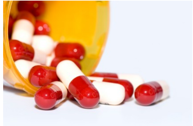
Coated Aspirin Tablets

Coatings are also particularly important in the confectionery industry, where sugar or vegetable oil based coatings are applied to sweet products to create layering or seal in soft centers.