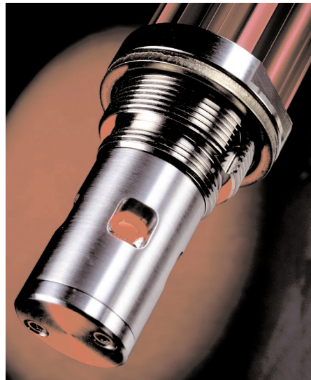
High Temperature Sensor

Fuel Cell technologies hold promise for a greener future in the automotive industry and Michell Instruments is in a strong position to be able to provide a humidity measurement solution to suit the applications of either industry.