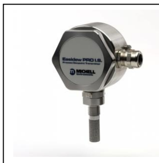
Easidew PRO I.S.